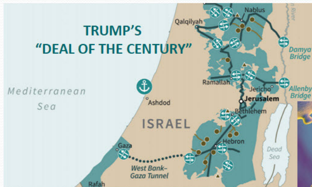
Plan Unveiled on 1.28.20