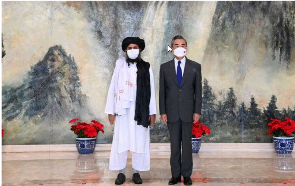
Chinese State Councilor and Foreign Minister Wang Yi (R) meeting with Mullah Abdul Ghani Baradar, political chief of Afghanistan's Taliban, in Tianjin

(July 28, 2021, Al Jazeera) China's foreign minister has met a Taliban delegation, signaling warming ties as the United States-led foreign forces continue their withdrawal from Afghanistan.