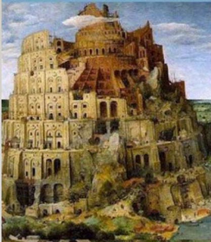
TOWER OF BABEL BY BRUEGHEL